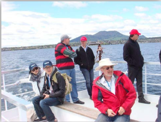
Lake Taupo cruising at the 2011 Gas Forum